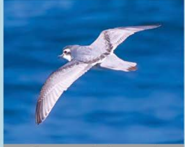
There are over 2 million pairs of slender-billed prions on New Island.

The New Island Group terrestrial KBA, also designated as an Important Bird Area, recognises the value of a number of restricted-range species, including all three Falkland Island endemic bird species – Cobb's wren, tussacbird and Falkland steamer duck; a number of sub-species including ruddy-headed goose and black-throated finch; and regionally limited species, such as the striated caracara. New Island is also recognised as a KBA for the significant overall number of combined breeding seabirds. This includes white-chinned petrel, imperial cormorant and Magellanic penguin along with other seabirds breeding on New Island whose foraging areas include them in the inshore marine KBA namely: black-browed albatross, gentoo penguin, the endemic Falkland steamer duck, brown skua, dolphin gull, southern rockhopper penguin and the slender-billed prion.