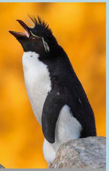
Southern rockhopper penguin