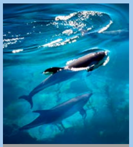
Peale's Dolphins can be seen close to the islands