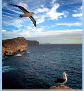
New Island has some of the most accessible albatross colonies in the Falklands